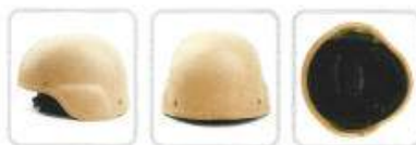
MICH Defeat Threat Level IIIA (NIJ STD 0106.01) Fabric: Kevlar Twaron with aramid composite Color: Kaki, Olive Green, Black