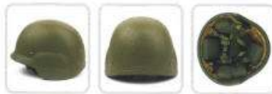
PASGT Defeat Threat Level IIIA (NIJ STD 0106.01) Fabric: Kevlar Twaron with aramid composite Color: Kaki, Olive Green, Black