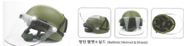
방탄 헬멧 & 실드 (Ballistic Helmet & Shield)

**** Please contact us; if you need more information about Seoul Internationals Ballistic Helmets and accessories!