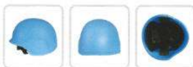
UN Helmet Defeat Threat Level IIIA (NIJ STD 0106.01) Fabric: Kevlar Twaron with aramid composite Color: UN Blue